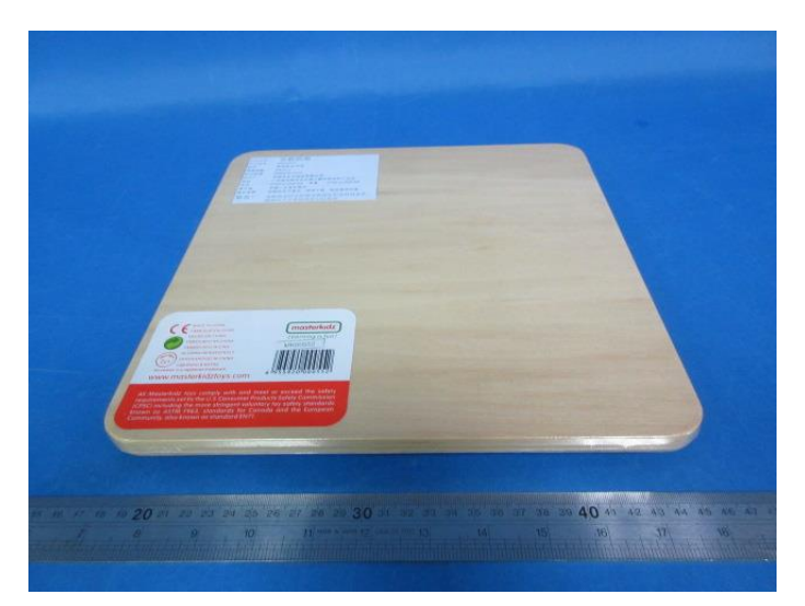
****** THE END ******

This letter / report / certificate shall not be reproduced (except in full version) without the written approval of UL VS Shanghai Limited Shenzhen Branch. ("UL VS")